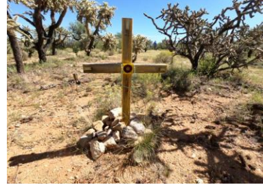
A cross marking the place where a migrant died in the desert.